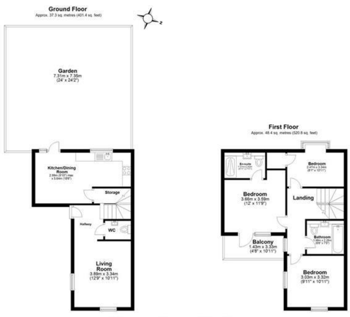
Total area: approx. 85.7 sq. metres (922.3 sq. feet) Bata Mews