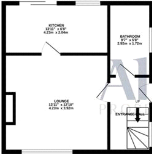
GROUND FLOOR 382 sq.ft. (35.5 sq.m.) approx.