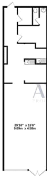
BASEMENT FLOOR 463 sq.ft. (42.7 sq.m.) approx.