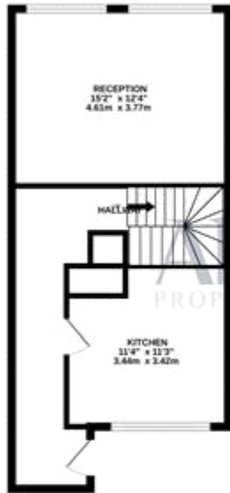
GROUND FLOOR 400 sq.ft. (37.2 sq.m.) approx.