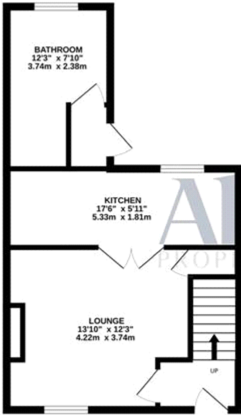
GROUND FLOOR 414 sq.ft. (38.5 sq.m.) approx.