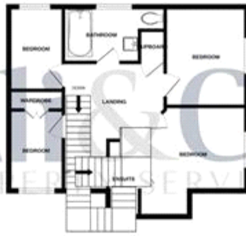
1ST FLOOR 556 sq ft. (51.9 sq.m.) approx.