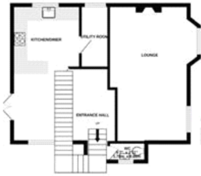
GROUND FLOOR 563 sq ft. (52.3 sq.m.) approx.