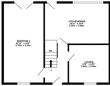
GROUND FLOOR 576 sq ft. (53.5 sq.m.) approx.