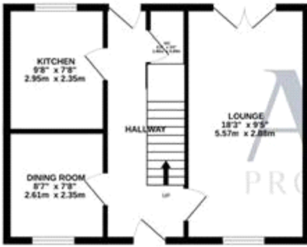
GROUND FLOOR 587 sq.ft. (54.5 sq.m.) approx.