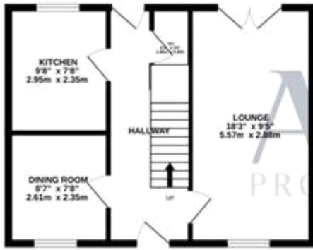
GROUND FLOOR 587 sq.ft. (54.5 sq.m.) approx.